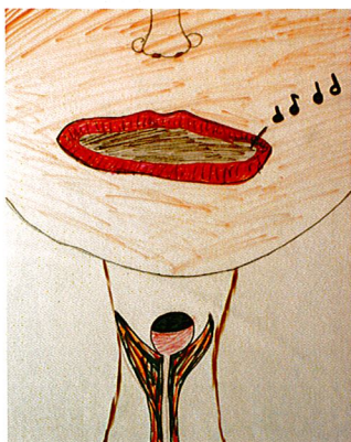
Lily (age 11)

Images are from the UPMC Voice Center World Voice Day artwork contest.