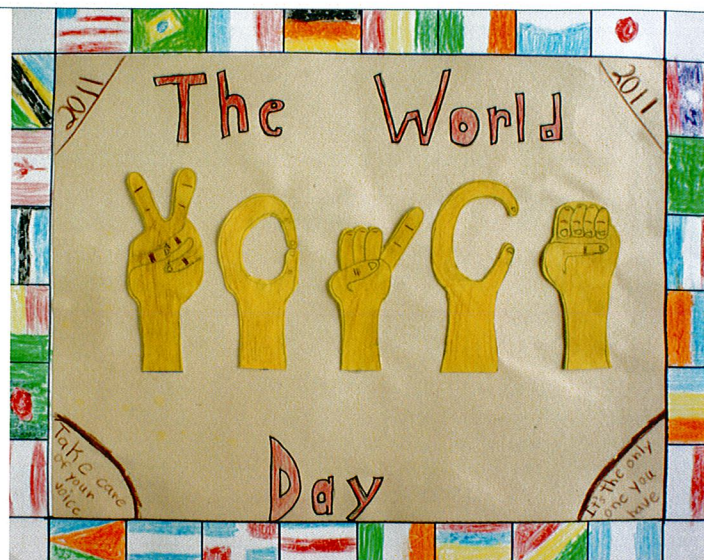
Isabella (age 10)

There are many simple and effective things that you can do to take better care of your voice and to prevent voice problems.